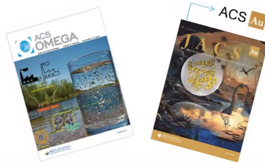
Fully Open Access